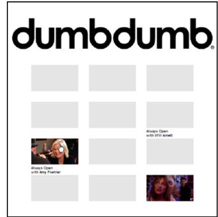
As the mouse moves over the thumbnails, the thumbnail image and captions appear.