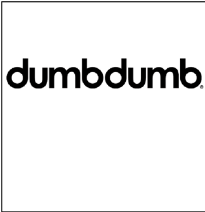
Initially, the page just shows an image overlay.

A wordpress video gallery plugin that will be able to show videos in a grid layout (similar to dumbdumb.com). The plugin needs to be able to insert a video gallery into any page or post. It would be nice if the plugin could insert the video gallery inside widgets also, but this is not critical.